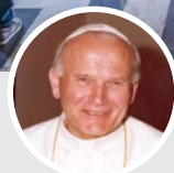
St John Paul II